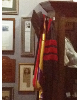
D-Min w/o Piping